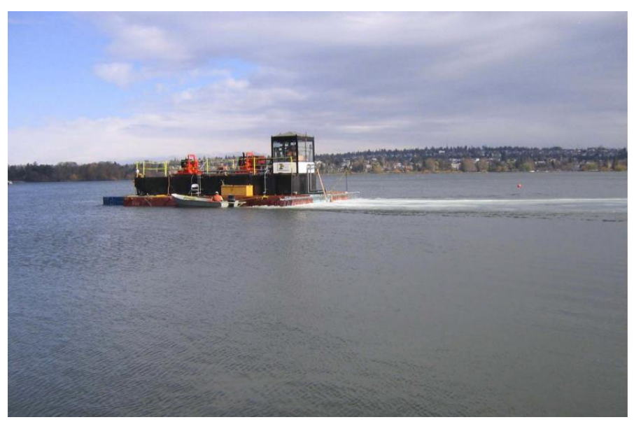
2004 Alum Treatment at Green Lake. From: Rob Zisette, Herrera Environmental Consultants, "Green Lake Alum Treatment – Dose for a Decade" (for Water Center Seminars, 2008), at Adobe p 24, online: <a href="https://digital.lib.washington.edu/researchworks/bitstream/handle/1773/16442/zisette.pdf?sequence=2">https://digital.lib.washington.edu/researchworks/bitstream/handle/1773/16442/zisette.pdf?sequence=2</a>.

After serious algae problems in the summers of 1999, 2002<sup>37</sup> and 2003, a more comprehensive dose of alum (441,000 gallons<sup>38</sup>) was added in 2004.<sup>39</sup> This treatment was estimated to cost $1.5 million and was projected to last for ten years – until 2015.<sup>40</sup> The treatment did lead to improved water quality and a reduction in phosphorus, but for a period of four and seven years, rather than the expected ten. The reduction in phosphorus was greater, and lasted longer, than the application in 1991, due to a much larger quantity of alum being applied.<sup>41</sup> One remaining problem is the overpopulation of invasive carp species, which stir up the bottom sediments and lead to phosphorus release (efforts to address this problem is discussed in section 1.4, below). Additionally, the presence of algae actually prevented the growth of an invasive plant called milfoil, so the clearer waters allowed for that weed to flourish – which necessitates further intervention.<sup>42</sup>